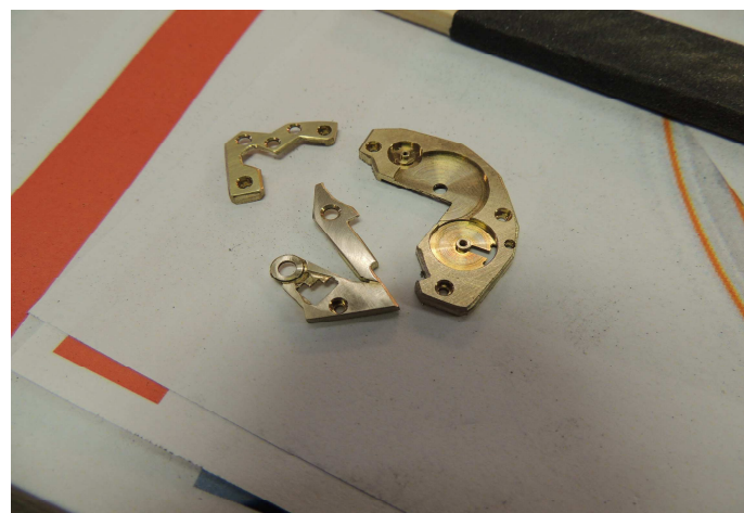
The result of sawing