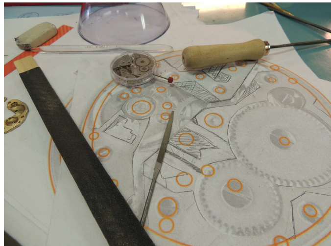
The first idea on paper

I am glad to say that the school gave me this opportunity and I hope that many other students get a chance to do this in the future. I think your personalty can grow, as well as, your workshop skills and your language skills, you can fiend friends and have a look at a different culture. Experience is a gift, which no one can take away.